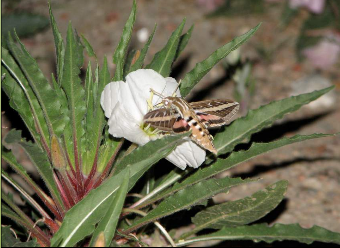
Fig. 1b: Hyles lineata visiting Oenothera harringtonii

We hypothesize that S-(+)-linalool will positively influence pollinator visitation to flowers, and that plants producing it will therefore be pollinated more often, resulting in higher fitness, than linalool-deficient plants. We further hypothesize that linalool mediates interactions with herbivores, and that plants that do not produce the compound are under selection to reduce herbivory and should have lower levels of herbivory and fitness than plants that produce linalool. We tested these hypotheses in a common garden setting near Flagstaff, AZ.