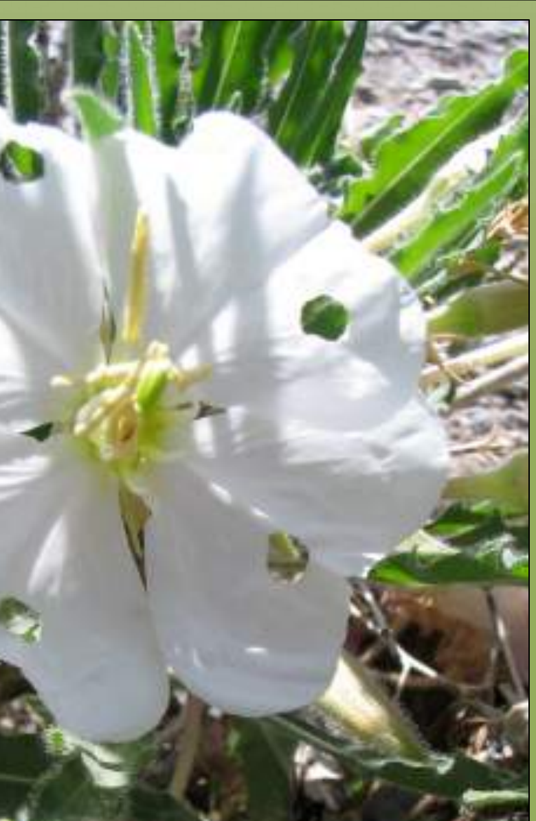
Fig. 8: Oenothera harringtonii with evidence of Hyles lineata damage

No significant differences were found in herbivory or pollination success in either chemotype of Oenothera harringtonii (Fig. 4-6). However, we did find a trend toward less herbivory in plants that produce S-(+)-linalool. In addition, fitness was significantly higher in linalool-producing plants (p < 0.05) (Fig. 7). This suggests that when they co-occur, selection may favor plants that produce S-(+)-linalool over those that do not produce the compound. Were the selection to be driven primarily by mutualists, we would expect to see linaloolproducing plants having higher levels of pollinator visitation and fitness and similar levels of herbivory compared to plants that do not produce linalool. Although pollinators and herbivores were not abundant, O. harringtonii is self incompatible, and therefore all fruit production occurred via insect-mediated cross pollination between plants. In the natural range of this species, co-occurrence of the two chemotypes may occur. If such is the case, we may see similar pollinator and herbivore behavior within this population, which may result in higher fitness in one of the two chemotypes- linalool (+) or