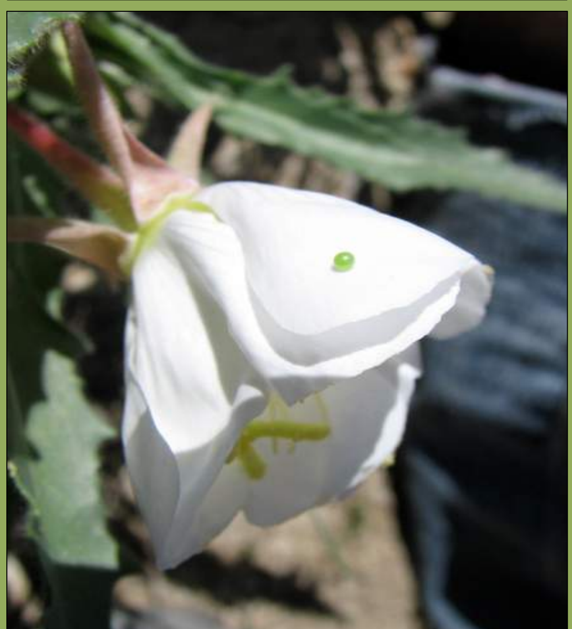
Fig. 2: A Hyles lineata egg on Oenothera harringtonii.