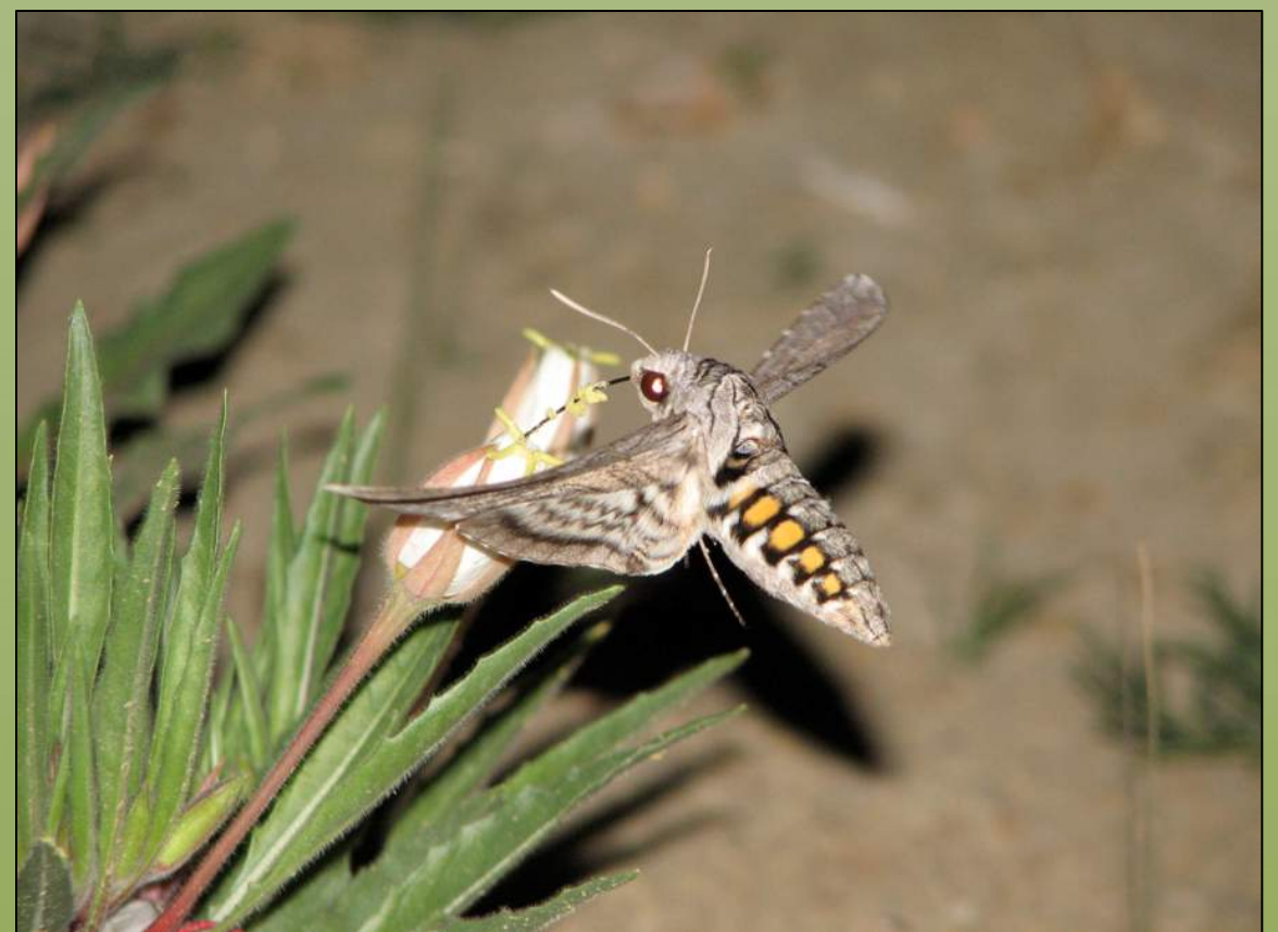
Fig. 1b: Manduca quinquemaculata visiting Oenothera harringtonii