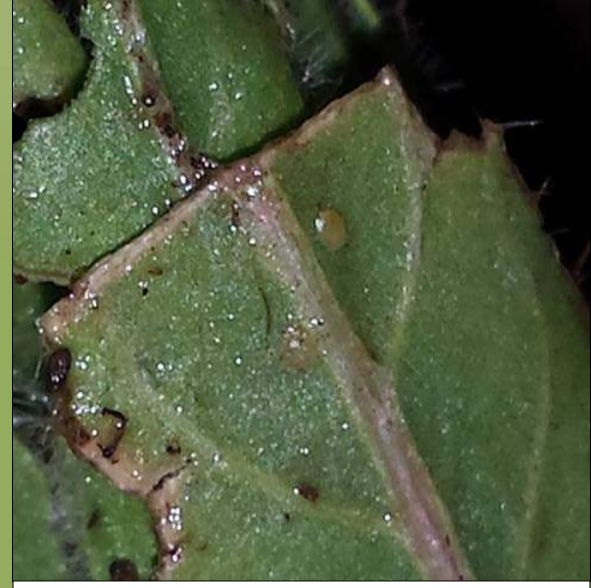
Fig. 9: Hemiptera eggs on an Oenothera harringtonii leaf