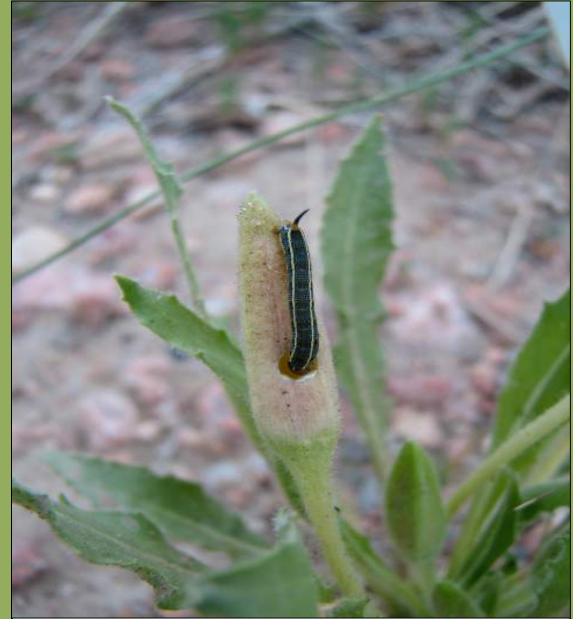
Fig. 3: Hyles lineata eating a bud of Oenothera harringtonii.